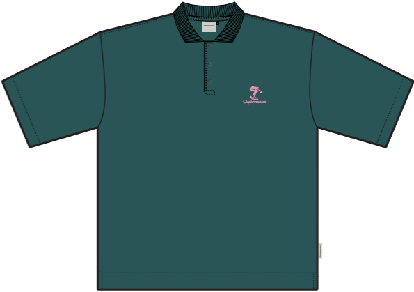
CXSHPROFP „Profi“, Organic Cotton Piquet, GOTS 33,90€ / 80€