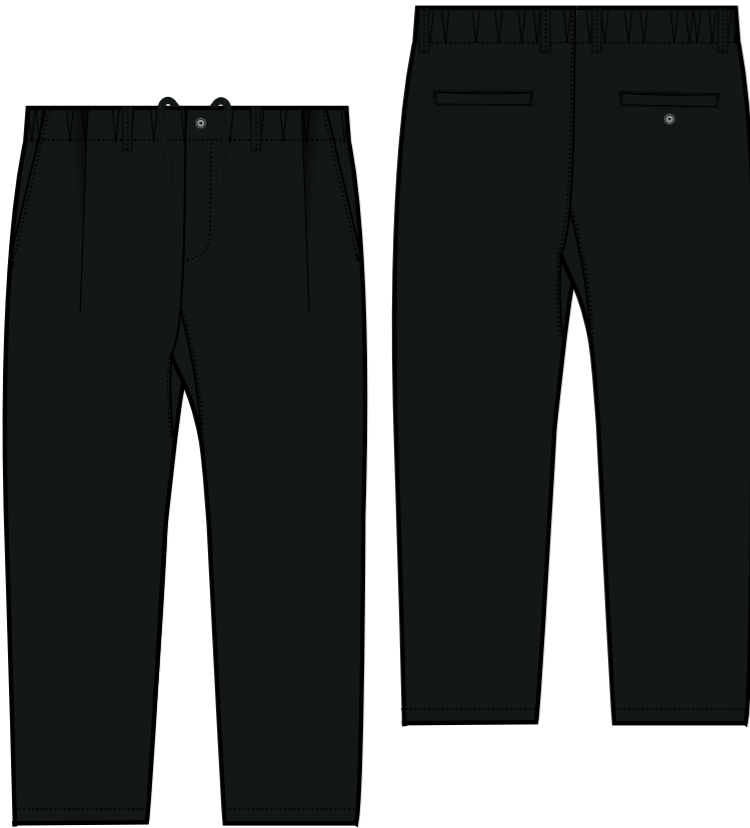
CXPCDAILO „Daily Office“ Organic Cotton-Elasthane 45,90€ / 110€