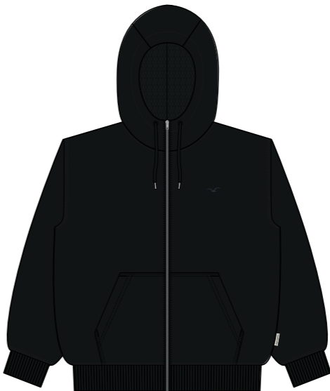
CXHZLIGLI „Ligull Lined“, American Fleece Organic Cotton, Waffle Lining, GOTS 45,90€ / 110€