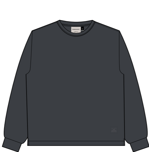
CXSWDOUBLE „Double“, Double Jersey 100% Organic Cotton, GOTS 37,90€ / 90€