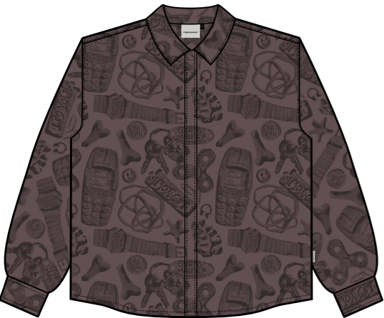
CXSHARTE „Artefacts“, 100% Organic Cotton Corduroy 45,90€ / 110€