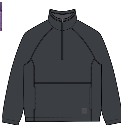
CXSWEAS „East“, Double Jersey 100% Organic Cotton, GOTS 54,90€ / 130€