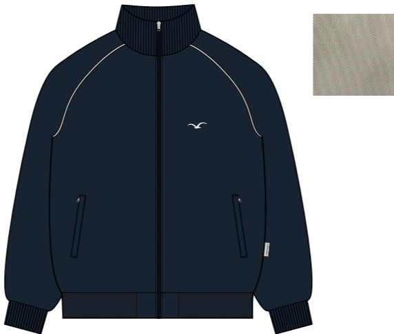
CXAJTRAIN „Trainer“, Recycled Polyester 45,90€ /100€