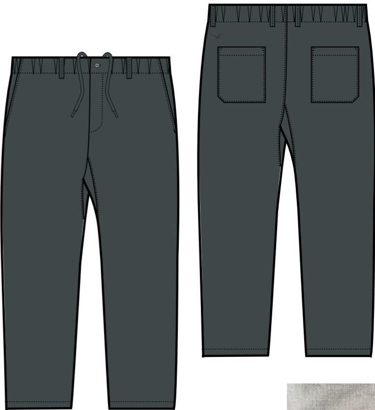
CXPCDAILW „Daily Work“ Organic Cotton Rip-Stop 45,90€ / 110€