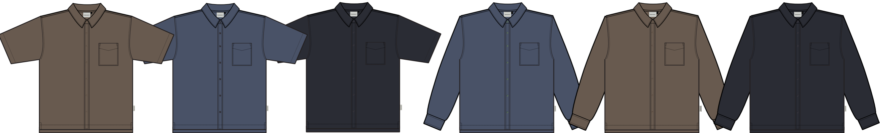
CXSHEASY „Easy“, 100% Lyocell, 37,90€ / 90€