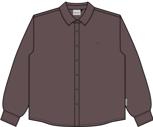
CXSHLIGCOR „Ligull Corduroy“, 100% Organic Cotton Corduroy 41,90€ / 100€