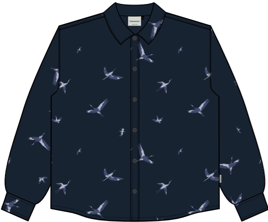
CXSHBIRDS „Birds“, 100% Lyocell 41,90€ / 100€