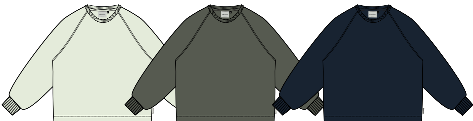
CXLSTRM „Thermal“, Waffle Interlock 100% Organic Cotton, GOTS 33,90€ / 80€