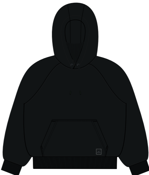
CXHSMASK „Mask Hooded“, American Fleece 100% Organic Cotton, GOTS 41,90€ / 90€