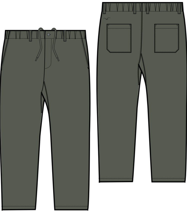
CXPCDAILWC „Daily Work Cord“ Organic Cotton Corduroy 45,90€ / 110€