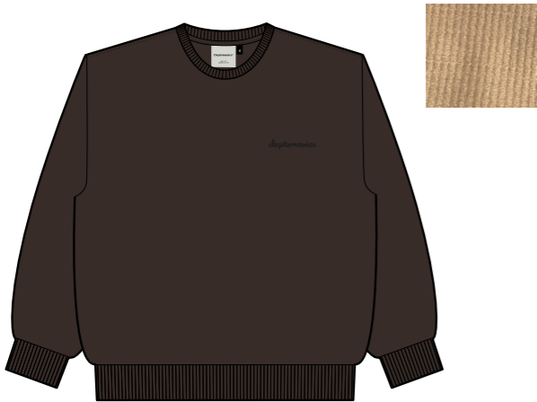
CXSWNICE „NICE“, Organic Structure Cotton, GOTS 37,90€ / 90€