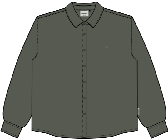
CXSHLIGFLA „Ligull Flannel“, Organic Cotton Brushed Flannel 41,90€ / 100€