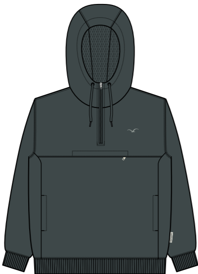
CXHSOGHO „OG Hooded“, Super Heavy American Fleece Organic Cotton, GOTS 54,90€ / 130€